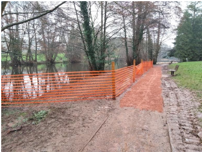
Pictures showing the progression of work to reclaim parts of the land surrounding the lake.