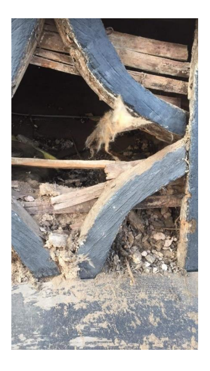
Pic. East gable before works