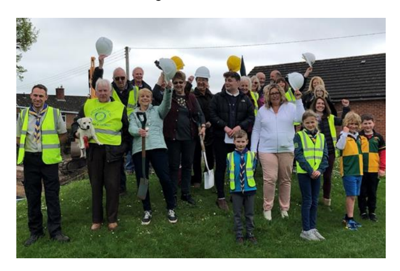
Pic: Residents, community organisations and councillors, getting the new building project off to a flying start.

Newent Recreation Ground Trust was delighted to announce that work has started on the long-awaited Community Pavilion. A small "ground-breaking" ceremony took place on the Coronation Bank Holiday Monday. Newent residents, community organisations, trustees and councillors came together to celebrate the start of construction works; the culmination of huge efforts across the town.