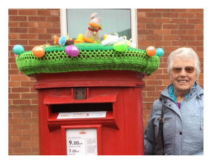
May by Post box near Newent Surgery