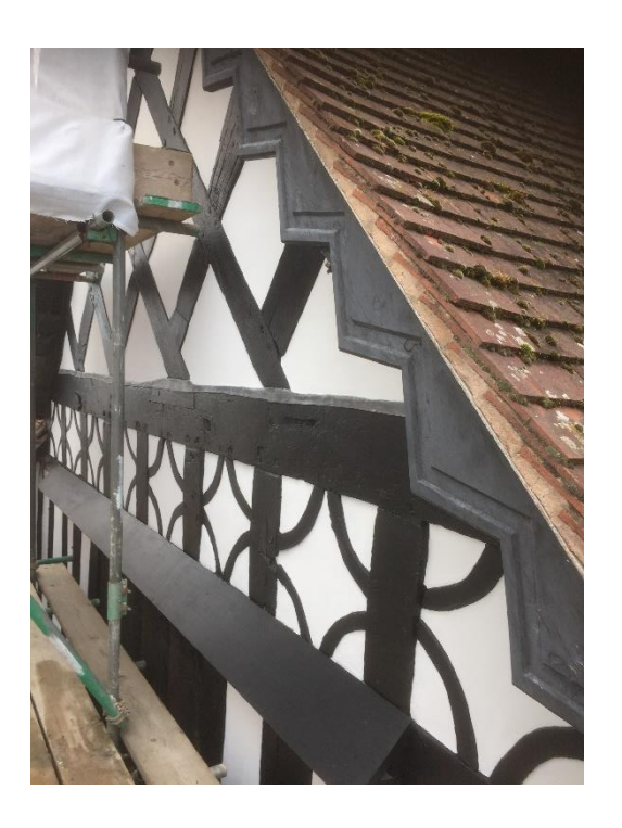
Pic. East gable completed