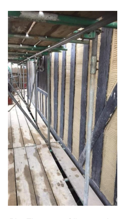
Pic. First coat of lime render

The refurbishment is going well and on schedule to be completed in June. The photos below show some of the works in hand/finished.