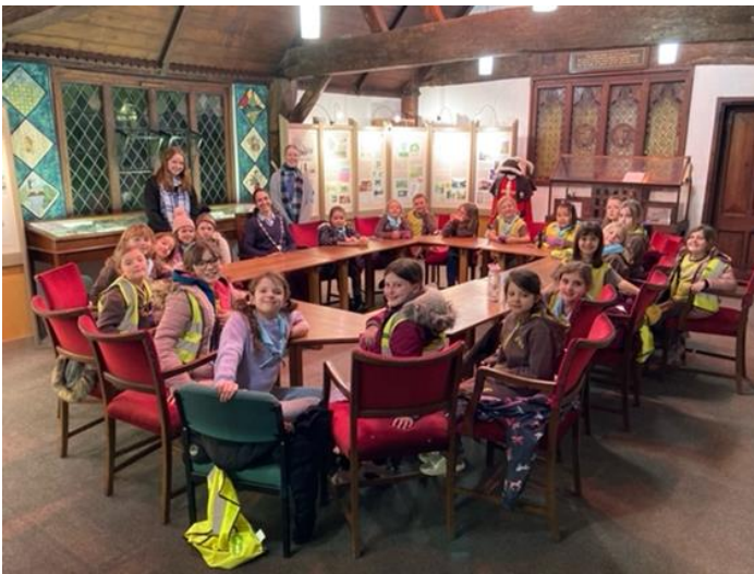
Pic. 1 st Newent Brownies and the Mayor, inside Newent Market House

On the evening of the 23 rd January, 1st Newent Brownies excitedly donned their hats and scarfs, plus hi-vis jackets and walked to the Market House for a very important event – an audience with the Mayor herself. All were thrilled to not only go upstairs into the Market House, a rare treat, but to have the chance to talk to the Mayor. The evening was part of the Brownie Local History badge, with the aim to meet someone who could tell the Brownies more about their town. With questions the Brownies wrote and asked themselves, the Mayor enthralled the Unit with her interesting tales of the town's history and her experience in her role. Rounding off the evening with a chance to look at the various historical artefacts around the room, and taking some momentous leaflets and town maps, the Brownies all had a fantastic time, and talked all about the activity all the way back! A huge thank you to Mayor for such a wonderful evening!