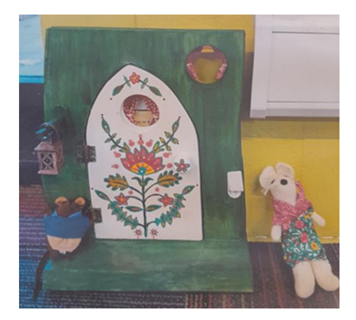
Fairy Door at Newent Library

The Men's Shed is heavily involved with other organisations in Newent. For example, it has installed a new ramp at the Recycling Shed, storage units at the Chill Out & a bench in the community garden, a fairy door & raised bed at the library, refurbished an old dolls house & made coasters at The Ark plus a noticeboard at Tibberton School. Other items include hedgehog boxes, bat boxes and bird boxes.