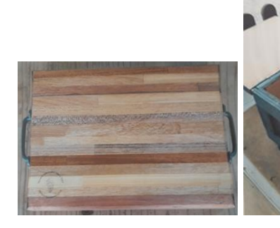
Seed Tray Sets